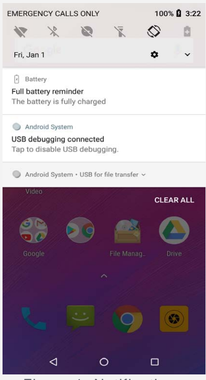
Figure 1: Notifications

The Notifications panel (see Figure 1: Notifications) informs you of missed calls, new messages, and activities in progress such as file downloading. The Quick Settings panel (see Figure 2: Quick Settings) allows you to access frequently-used settings such as the Wi-Fi switch.